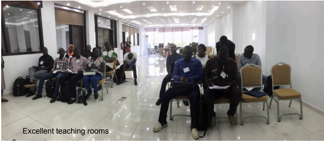
Excellent teaching rooms