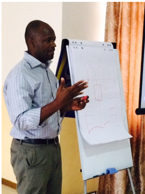
Teaching and the venue