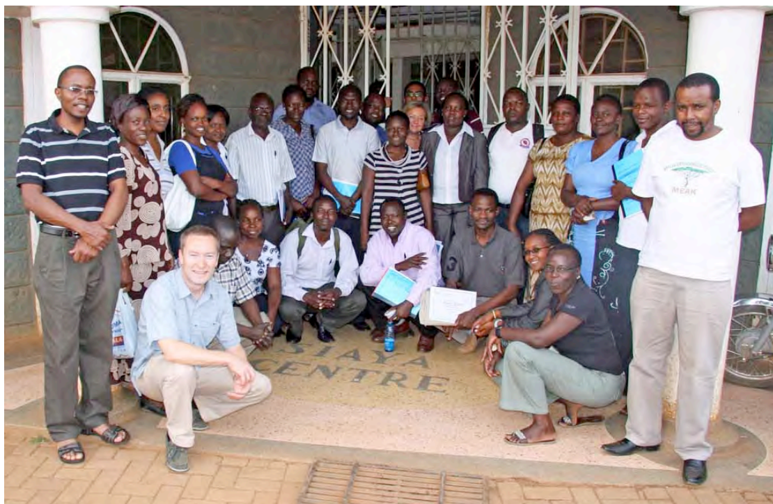
Day 3&4 trainees with local and visiting instructors at the Siaya centre entrance