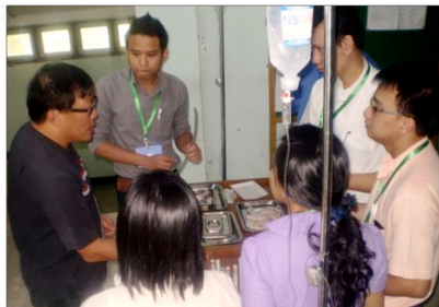
JK at the Vascular Access Skill Station