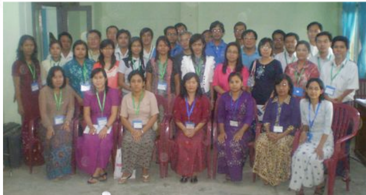
One of the July 2011 Graduation Group