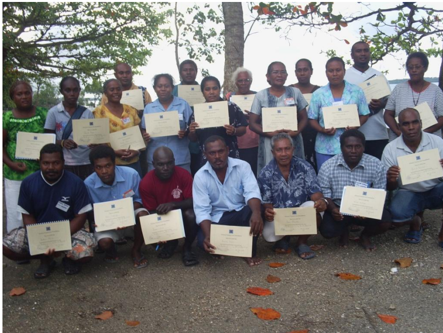
Figure 1: PTC-Buala March 18-19, 2009, participants with their certificates after the course.