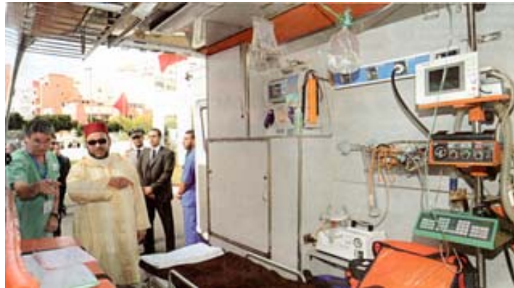
Visit of HM the King of Morocco to SAMU Casablanca

Secondly there appears to be a great need to develop pre-hospital care in Morocco. We heard of many cases of trauma cases being brought to hospital lying prone with no oxygen, c-spine protection, monitoring or fluids. The inauguration this week of the Casablanca SAMU (a government funded medicalised ambulance service staffed by doctors) is an exciting initiative, and it is likely that this model will be reproduced in the other major centres. At present a large amount of the pre-hospital retrieval nationwide is done by the Protection Civile. This service has a fleet of modern vehicles and is run by firemen trained in retrieval. There would appear to be an excellent potential to train these fire personnel in the principles of PTC, adapted to their pre-hospital role. However this service comes under the Ministry of the Interior, running in parallel to the services provided to the Ministry of Health, and so may require a separate PTC initiative. Dr Chris Lambert will investigate this possibility. The involvement of PTC instructors with special interest in pre-hospital care would be invaluable.