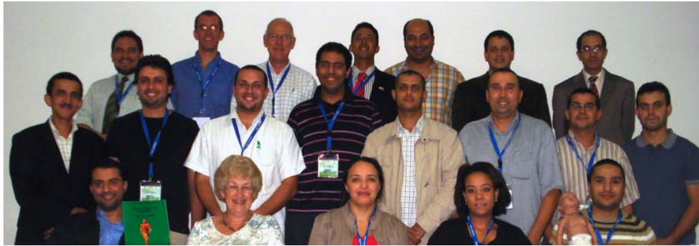
Instructor Course Participants